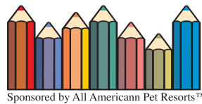
Sponsored by All American Pet Resorts™